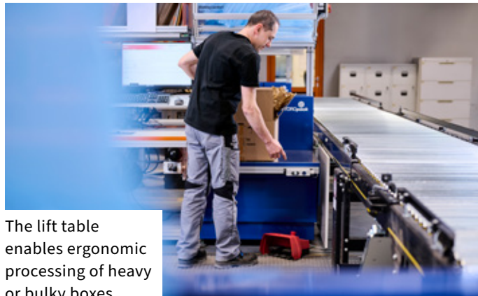
The lift table enables ergonomic processing of heavy or bulky boxes.